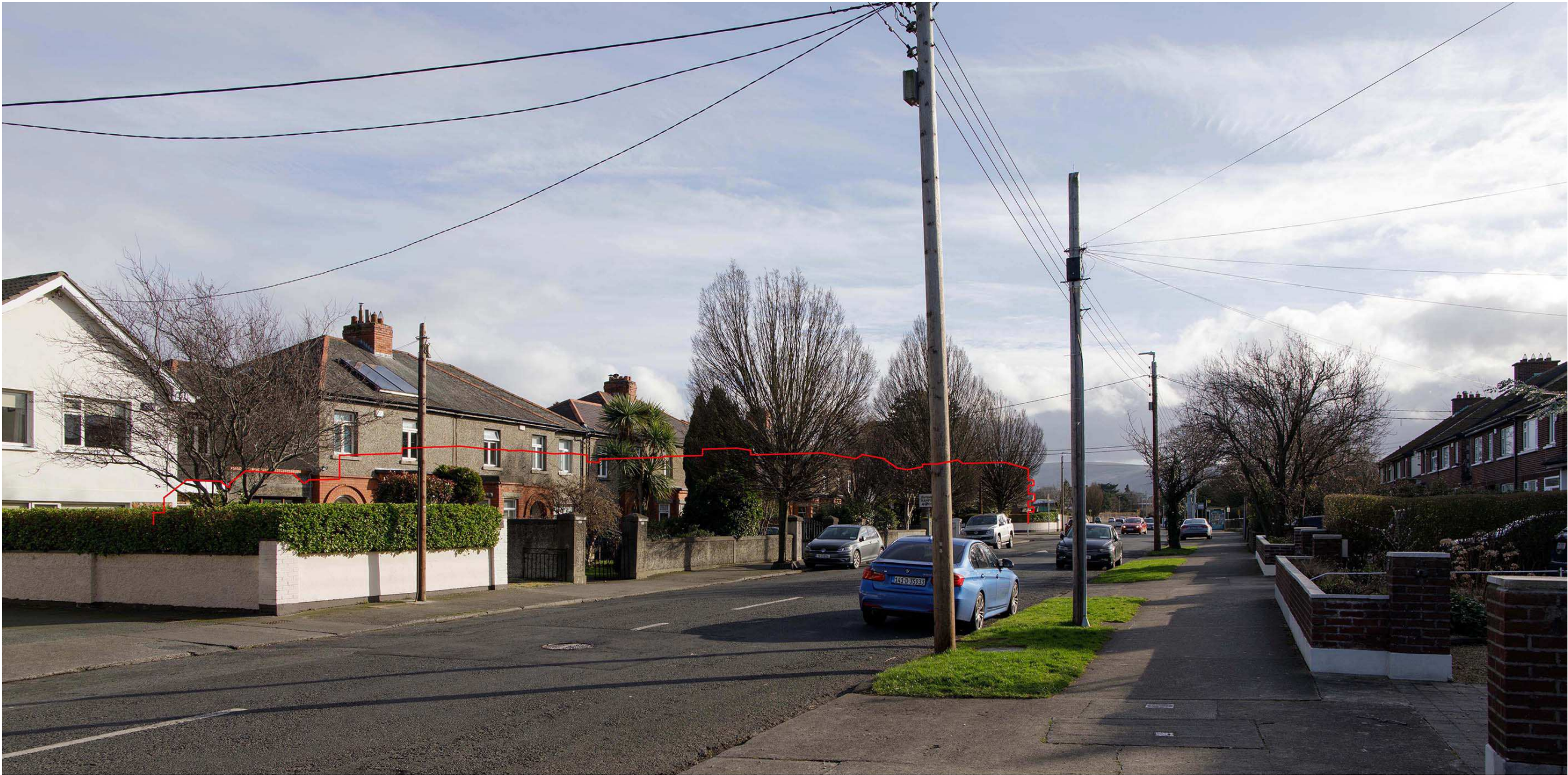
◀◀ Angle of View 73° Horizontal ( 24 mm Lens ) ◀ Angle of View 39° Horizontal ( 50 mm Lens ) ▶▶

NOTE: This document is for discussion purpose only. All figures shown are an approximate estimation and are subject to further design development, accurate site survey and services (drainages, ESB, gas, etc.) and potential existing site restrictions (flooding, trees preservation, traffic, fire etc.). Please note also that any proposed concept layout in this document is subject to full planning permission being granted.