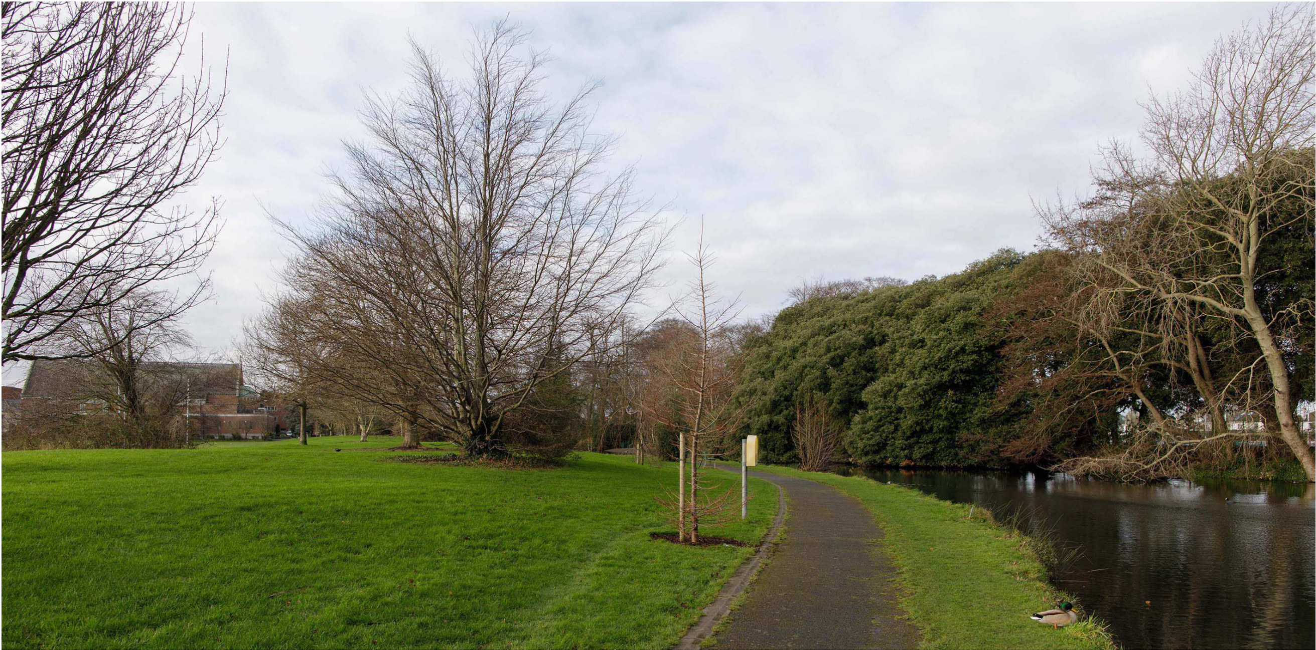
◀◀ Angle of View 73° Horizontal ( 24 mm Lens ) ◀ Angle of View 39° Horizontal ( 50 mm Lens ) ▶▶

NOTE: This document is for discussion purpose only. All figures shown are an approximate estimation and are subject to further design development, accurate site survey and services (drainages, ESB, gas, etc.) and potential existing site restrictions (flooding, trees preservation, traffic, fire etc.). Please note also that any proposed concept layout in this document is subject to full planning permission being granted.