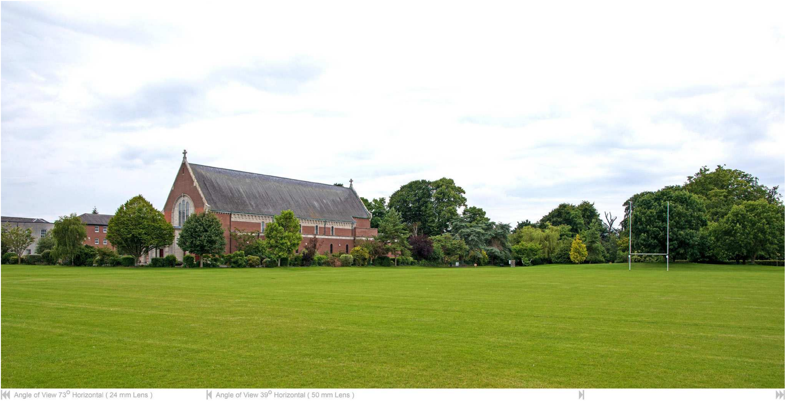
Angle of View 73° Horizontal ( 24 mm Lens ) Angle of View 39° Horizontal ( 50 mm Lens )

NOTE: This document is for discussion purpose only. All figures shown are an approximate estimation and are subject to further design development, accurate site survey and services (drainages, ESB, gas, etc.) and potential existing site restrictions (flooding, trees preservation, traffic, fire etc.). Please note also that any proposed concept layout in this document is subject to full planning permission being granted.