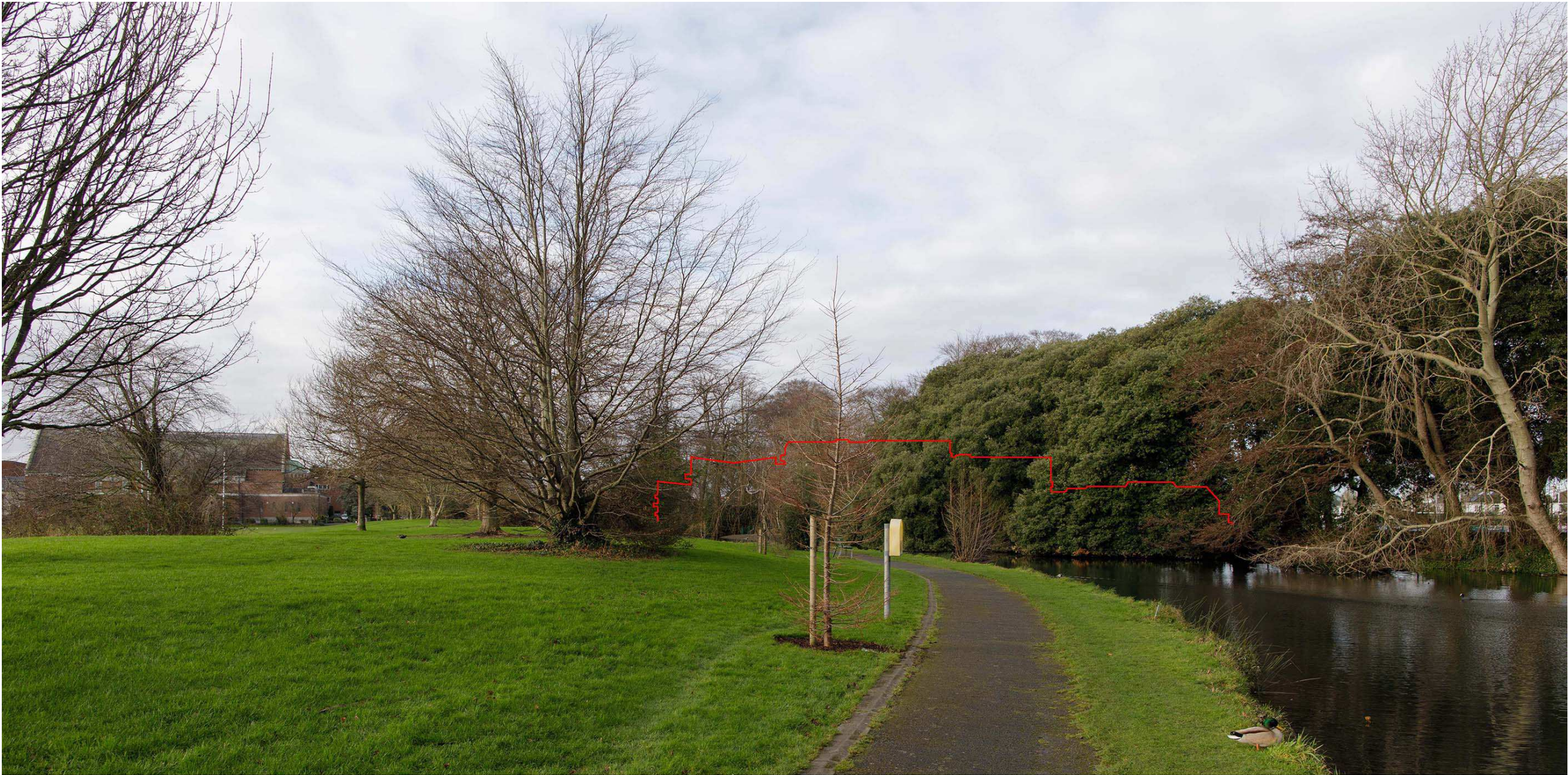
Angle of View 73° Horizontal ( 24 mm Lens ) Angle of View 39° Horizontal ( 50 mm Lens )

NOTE: This document is for discussion purpose only. All figures shown are an approximate estimation and are subject to further design development, accurate site survey and services (drainages, ESB, gas, etc.) and potential existing site restrictions (flooding, trees preservation, traffic, fire etc.). Please note also that any proposed concept layout in this document is subject to full planning permission being granted.