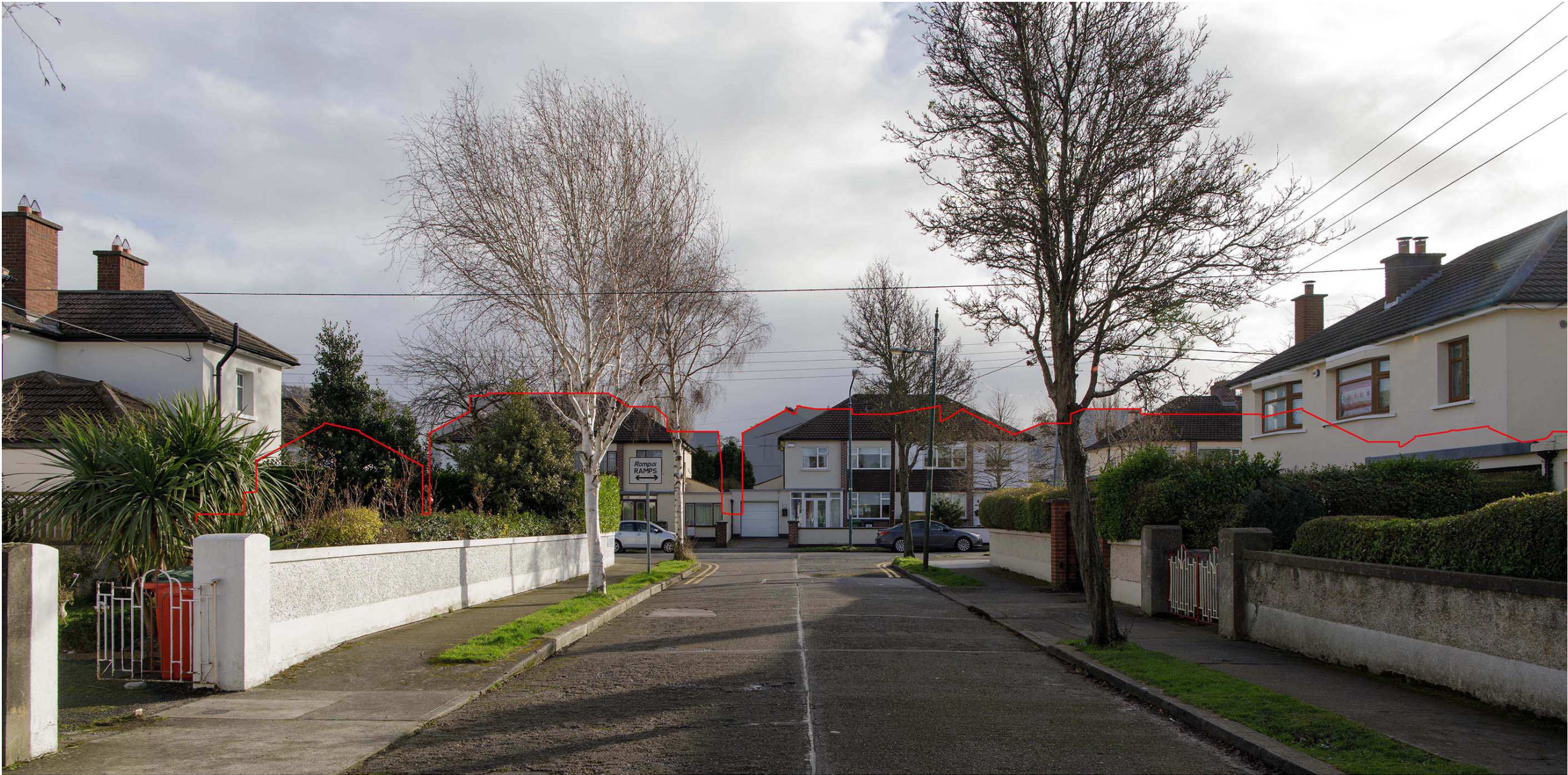
◀◀ Angle of View 73° Horizontal ( 24 mm Lens ) ◀◀ Angle of View 39° Horizontal ( 50 mm Lens ) ▶▶ ▶▶

NOTE: This document is for discussion purpose only. All figures shown are an approximate estimation and are subject to further design development, accurate site survey and services (drainages, ESB, gas, etc.) and potential existing site restrictions (flooding, trees preservation, traffic, fire etc.). Please note also that any proposed concept layout in this document is subject to full planning permission being granted.