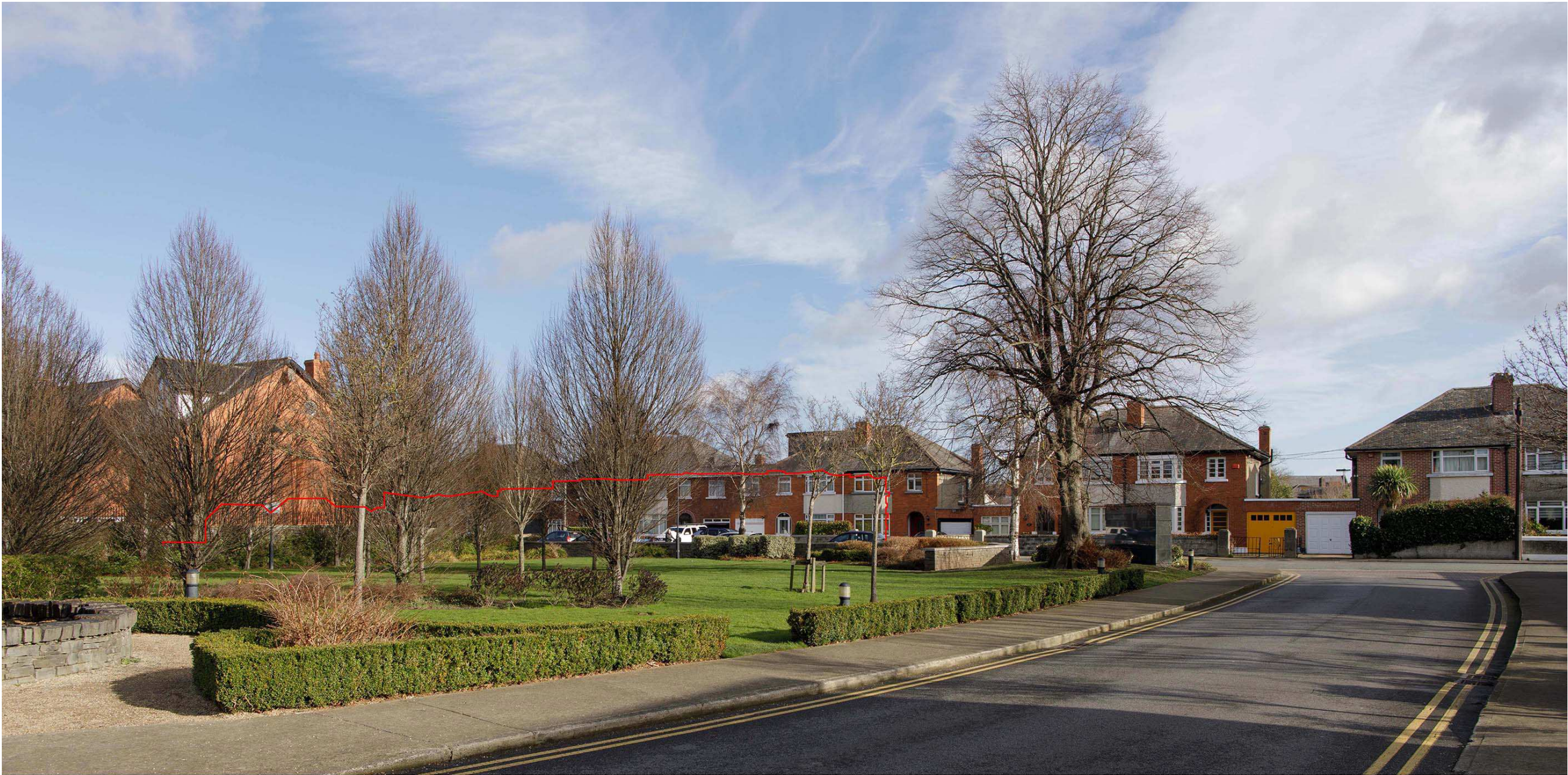
Angle of View 73° Horizontal ( 24 mm Lens ) Angle of View 39° Horizontal ( 50 mm Lens )

NOTE: This document is for discussion purpose only. All figures shown are an approximate estimation and are subject to further design development, accurate site survey and services (drainages, ESB, gas, etc.) and potential existing site restrictions (flooding, trees preservation, traffic, fire etc.). Please note also that any proposed concept layout in this document is subject to full planning permission being granted.