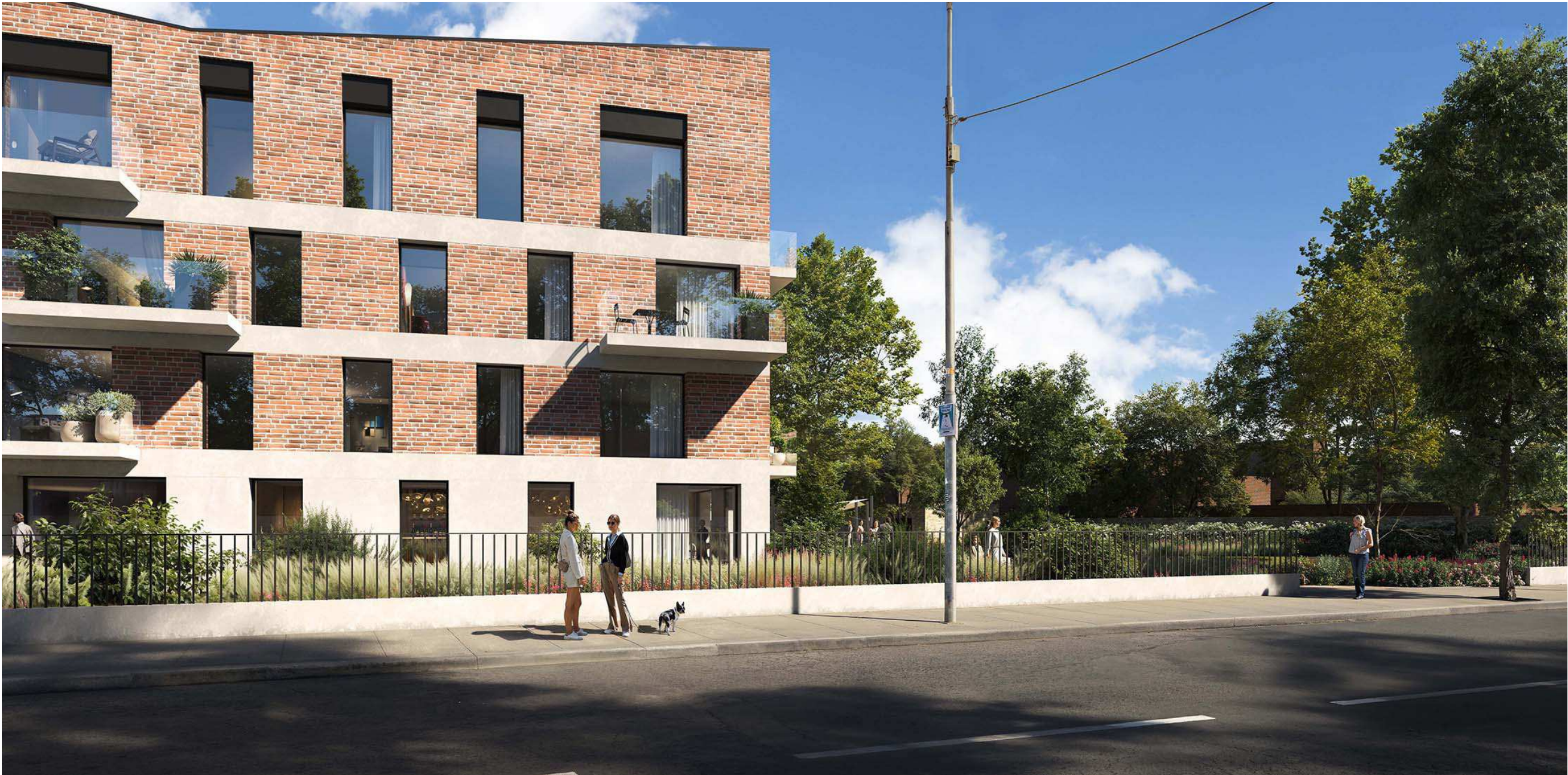
Angle of View 73° Horizontal ( 24 mm Lens ) Angle of View 39° Horizontal ( 50 mm Lens )

NOTE: This document is for discussion purpose only. All figures shown are an approximate estimation and are subject to further design development, accurate site survey and services (drainages, ESB, gas, etc.) and potential existing site restrictions (flooding, trees preservation, traffic, fire etc.). Please note also that any proposed concept layout in this document is subject to full planning permission being granted.