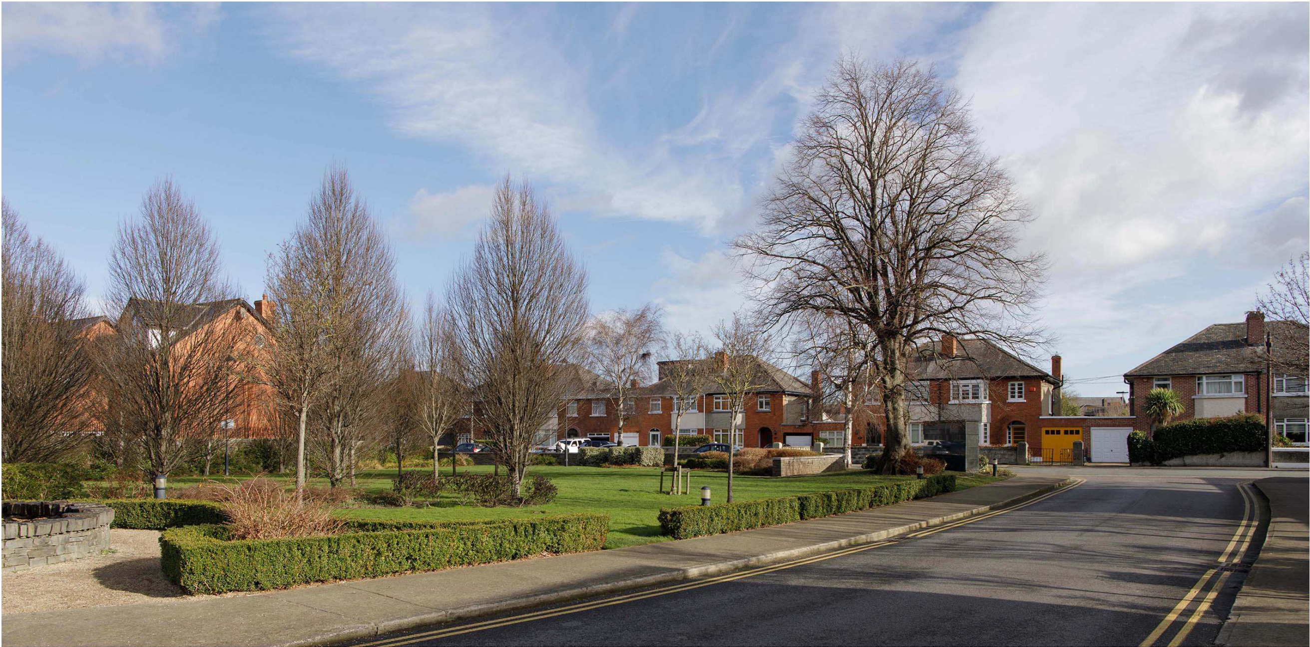
◀◀ Angle of View 73° Horizontal ( 24 mm Lens ) ◀ Angle of View 39° Horizontal ( 50 mm Lens ) ▶▶

NOTE: This document is for discussion purpose only. All figures shown are an approximate estimation and are subject to further design development, accurate site survey and services (drainages, ESB, gas, etc.) and potential existing site restrictions (flooding, trees preservation, traffic, fire etc.). Please note also that any proposed concept layout in this document is subject to full planning permission being granted.