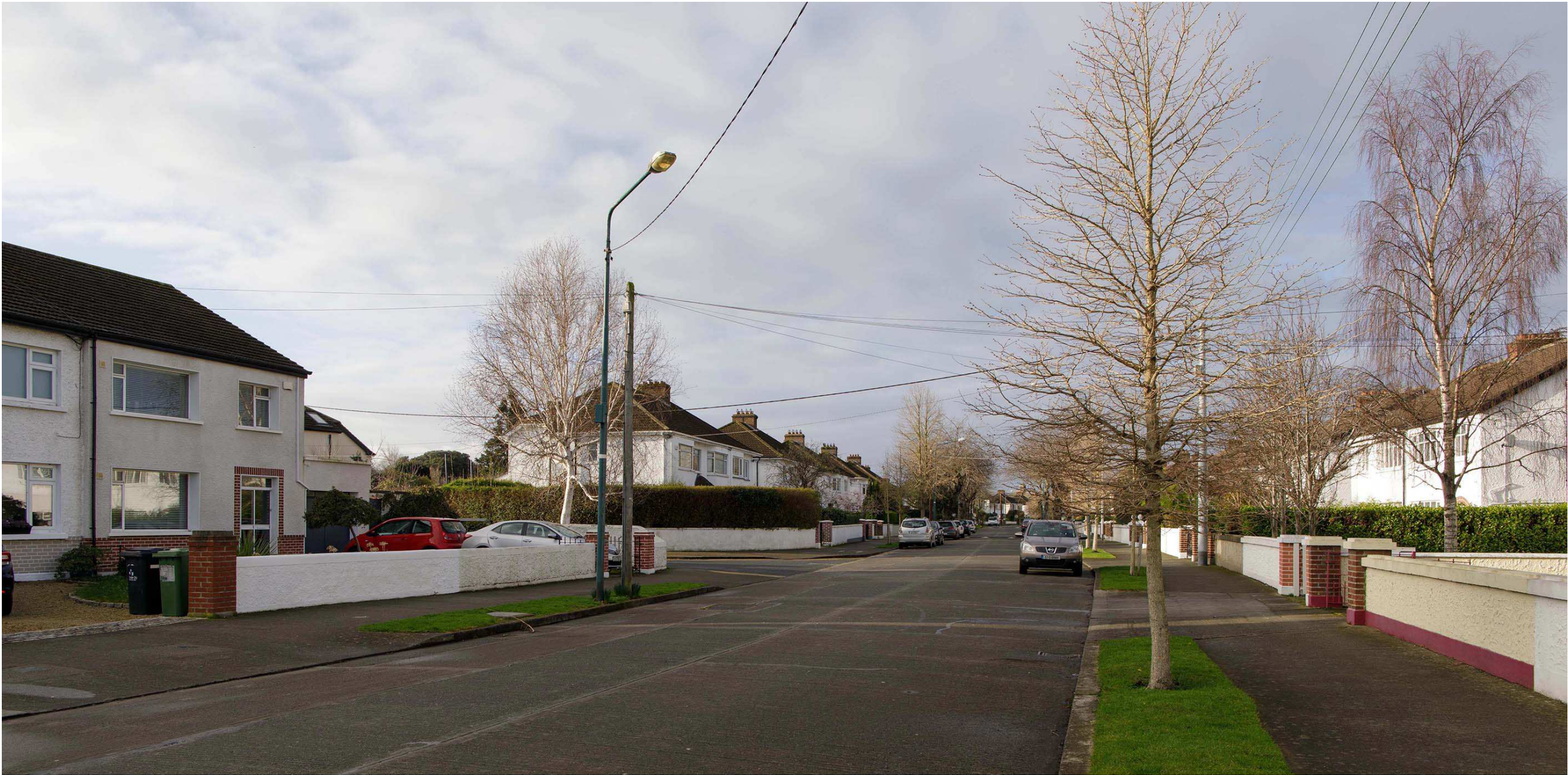
◀◀ Angle of View 73° Horizontal ( 24 mm Lens ) ◀◀ Angle of View 39° Horizontal ( 50 mm Lens ) ▶▶ ▶▶

NOTE: This document is for discussion purpose only. All figures shown are an approximate estimation and are subject to further design development, accurate site survey and services (drainages, ESB, gas, etc.) and potential existing site restrictions (flooding, trees preservation, traffic, fire etc.). Please note also that any proposed concept layout in this document is subject to full planning permission being granted.