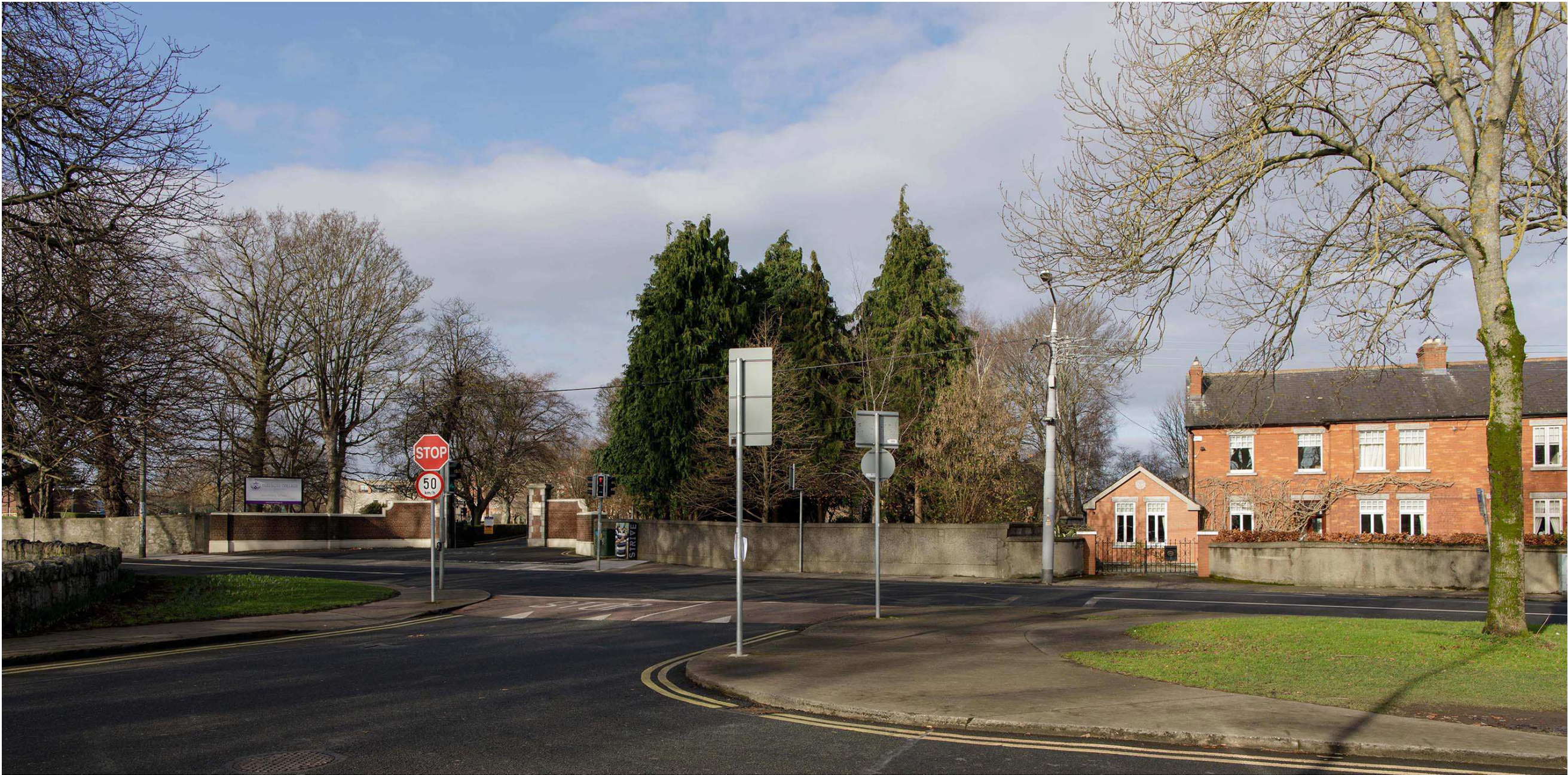
◀◀ Angle of View 73° Horizontal ( 24 mm Lens ) ◀ Angle of View 39° Horizontal ( 50 mm Lens ) ▶▶

NOTE: This document is for discussion purpose only. All figures shown are an approximate estimation and are subject to further design development, accurate site survey and services (drainages, ESB, gas, etc.) and potential existing site restrictions (flooding, trees preservation, traffic, fire etc.). Please note also that any proposed concept layout in this document is subject to full planning permission being granted.