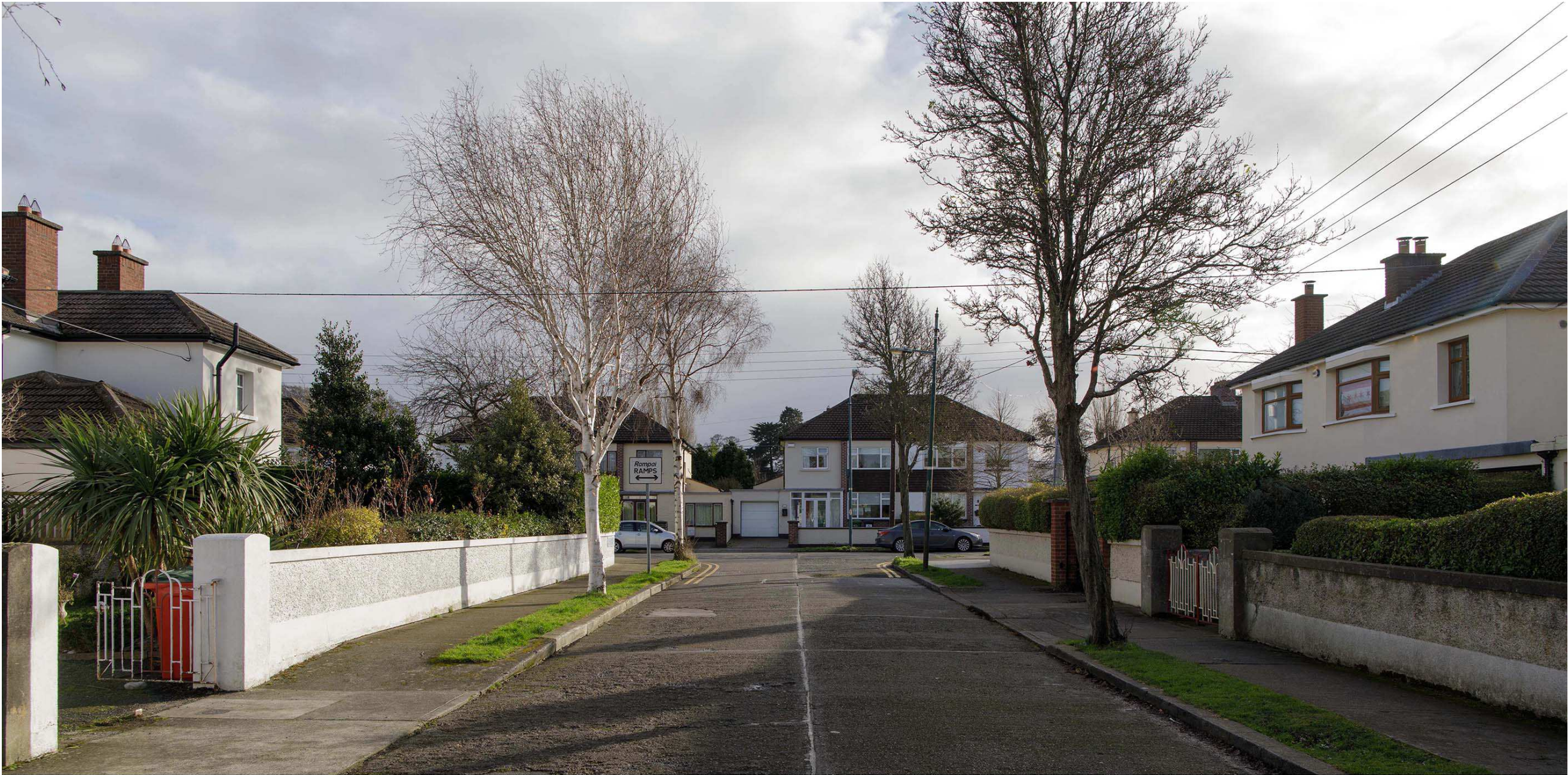
◀◀ Angle of View 73° Horizontal ( 24 mm Lens ) ◀ Angle of View 39° Horizontal ( 50 mm Lens ) ▶▶

NOTE: This document is for discussion purpose only. All figures shown are an approximate estimation and are subject to further design development, accurate site survey and services (drainages, ESB, gas, etc.) and potential existing site restrictions (flooding, trees preservation, traffic, fire etc.). Please note also that any proposed concept layout in this document is subject to full planning permission being granted.