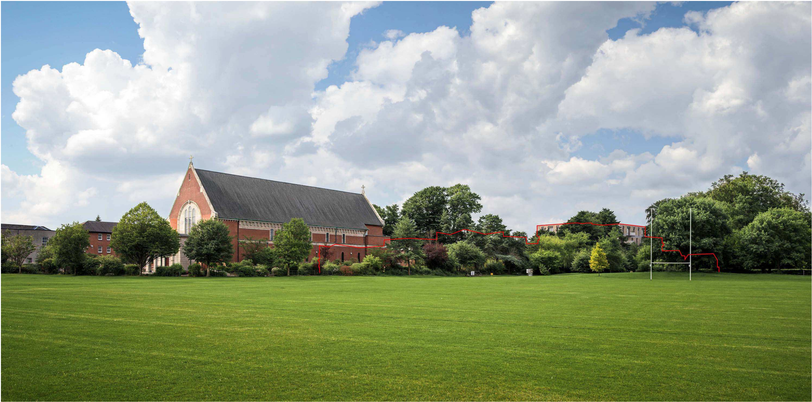
Angle of View 73° Horizontal ( 24 mm Lens ) Angle of View 39° Horizontal ( 50 mm Lens )

NOTE: This document is for discussion purpose only. All figures shown are an approximate estimation and are subject to further design development, accurate site survey and services (drainages, ESB, gas, etc.) and potential existing site restrictions (flooding, trees preservation, traffic, fire etc.). Please note also that any proposed concept layout in this document is subject to full planning permission being granted.