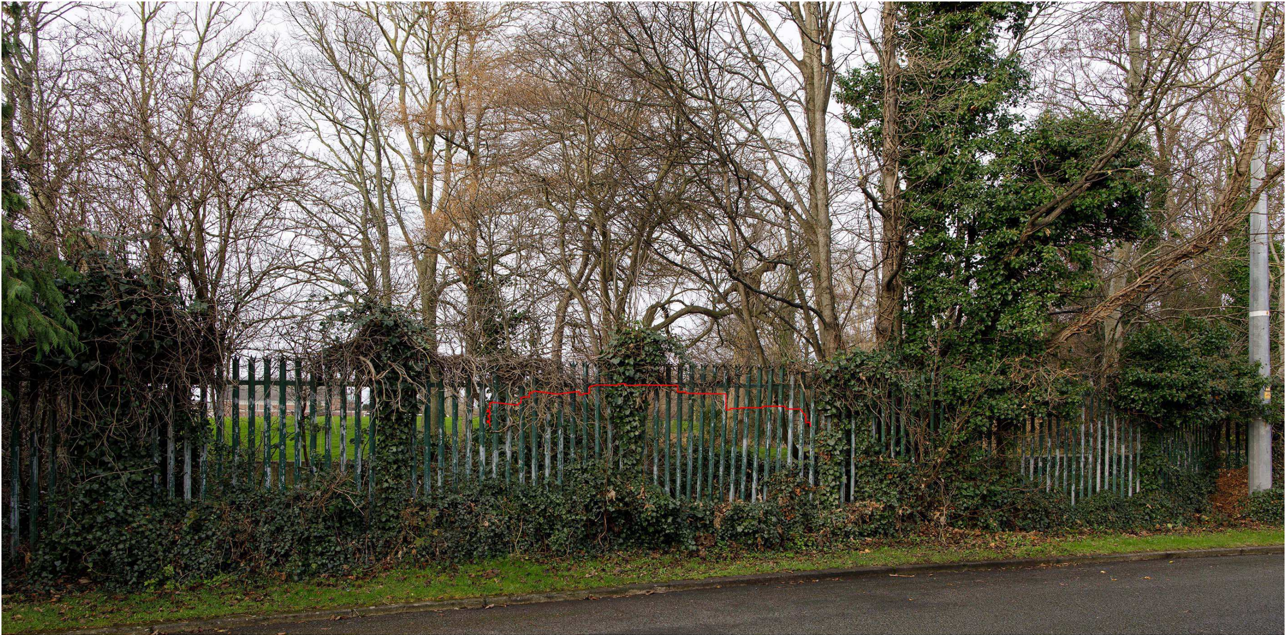
◀◀ Angle of View 73° Horizontal ( 24 mm Lens ) ◀◀ Angle of View 39° Horizontal ( 50 mm Lens ) ▶▶ ▶▶

NOTE: This document is for discussion purpose only. All figures shown are an approximate estimation and are subject to further design development, accurate site survey and services (drainages, ESB, gas, etc.) and potential existing site restrictions (flooding, trees preservation, traffic, fire etc.). Please note also that any proposed concept layout in this document is subject to full planning permission being granted.