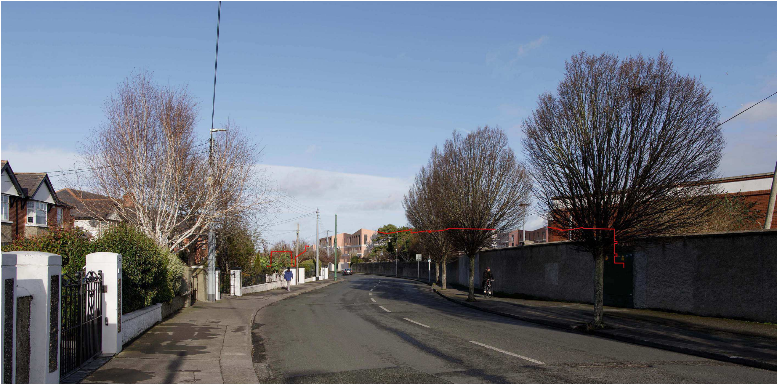
◀◀ Angle of View 73° Horizontal ( 24 mm Lens ) ◀ Angle of View 39° Horizontal ( 50 mm Lens ) ▶▶

NOTE: This document is for discussion purpose only. All figures shown are an approximate estimation and are subject to further design development, accurate site survey and services (drainages, ESB, gas, etc.) and potential existing site restrictions (flooding, trees preservation, traffic, fire etc.). Please note also that any proposed concept layout in this document is subject to full planning permission being granted.