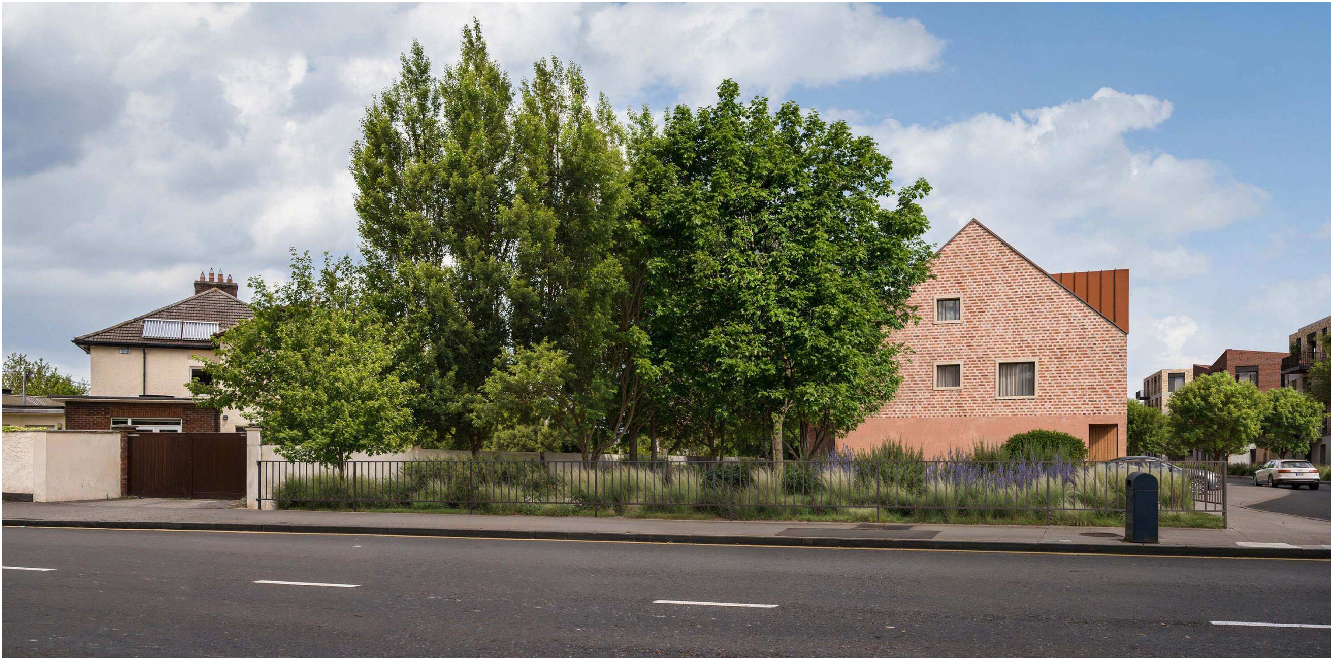
◀◀ Angle of View 73° Horizontal ( 24 mm Lens ) ◀ Angle of View 39° Horizontal ( 50 mm Lens ) ▶▶

NOTE: This document is for discussion purpose only. All figures shown are an approximate estimation and are subject to further design development, accurate site survey and services (drainages, ESB, gas, etc.) and potential existing site restrictions (flooding, trees preservation, traffic, fire etc.). Please note also that any proposed concept layout in this document is subject to full planning permission being granted.