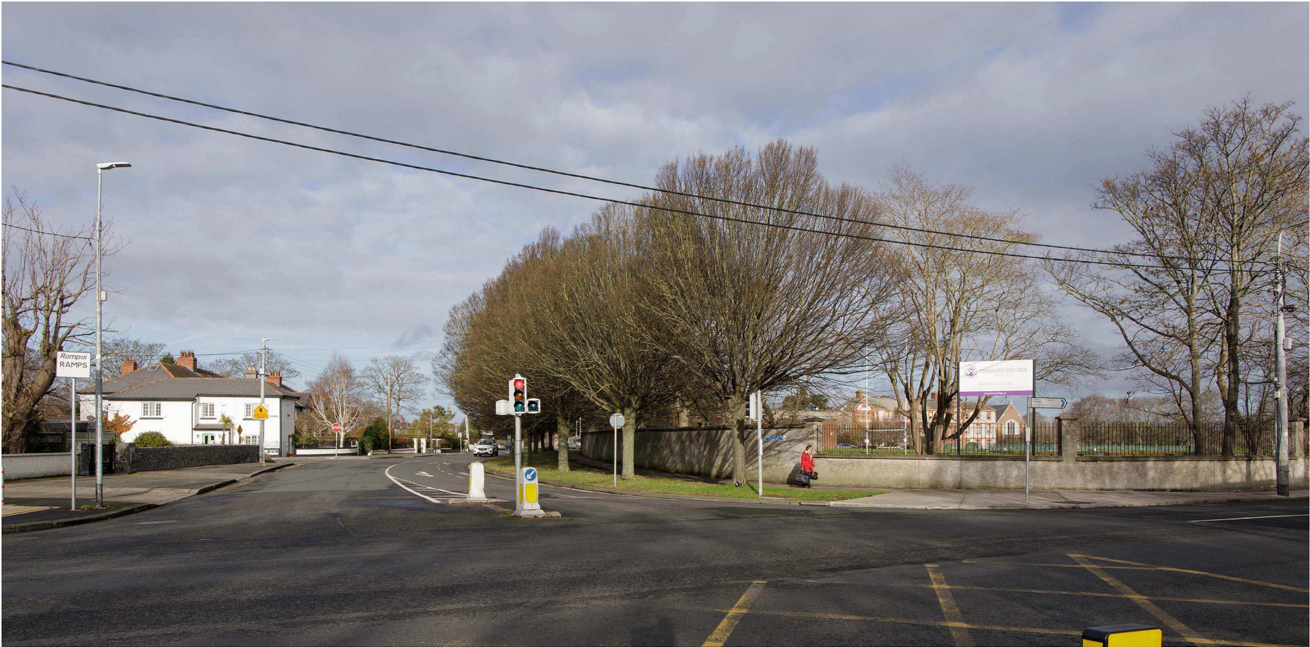
◀◀ Angle of View 73° Horizontal ( 24 mm Lens ) ◀ Angle of View 39° Horizontal ( 50 mm Lens ) ▶▶

NOTE: This document is for discussion purpose only. All figures shown are an approximate estimation and are subject to further design development, accurate site survey and services (drainages, ESB, gas, etc.) and potential existing site restrictions (flooding, trees preservation, traffic, fire etc.). Please note also that any proposed concept layout in this document is subject to full planning permission being granted.