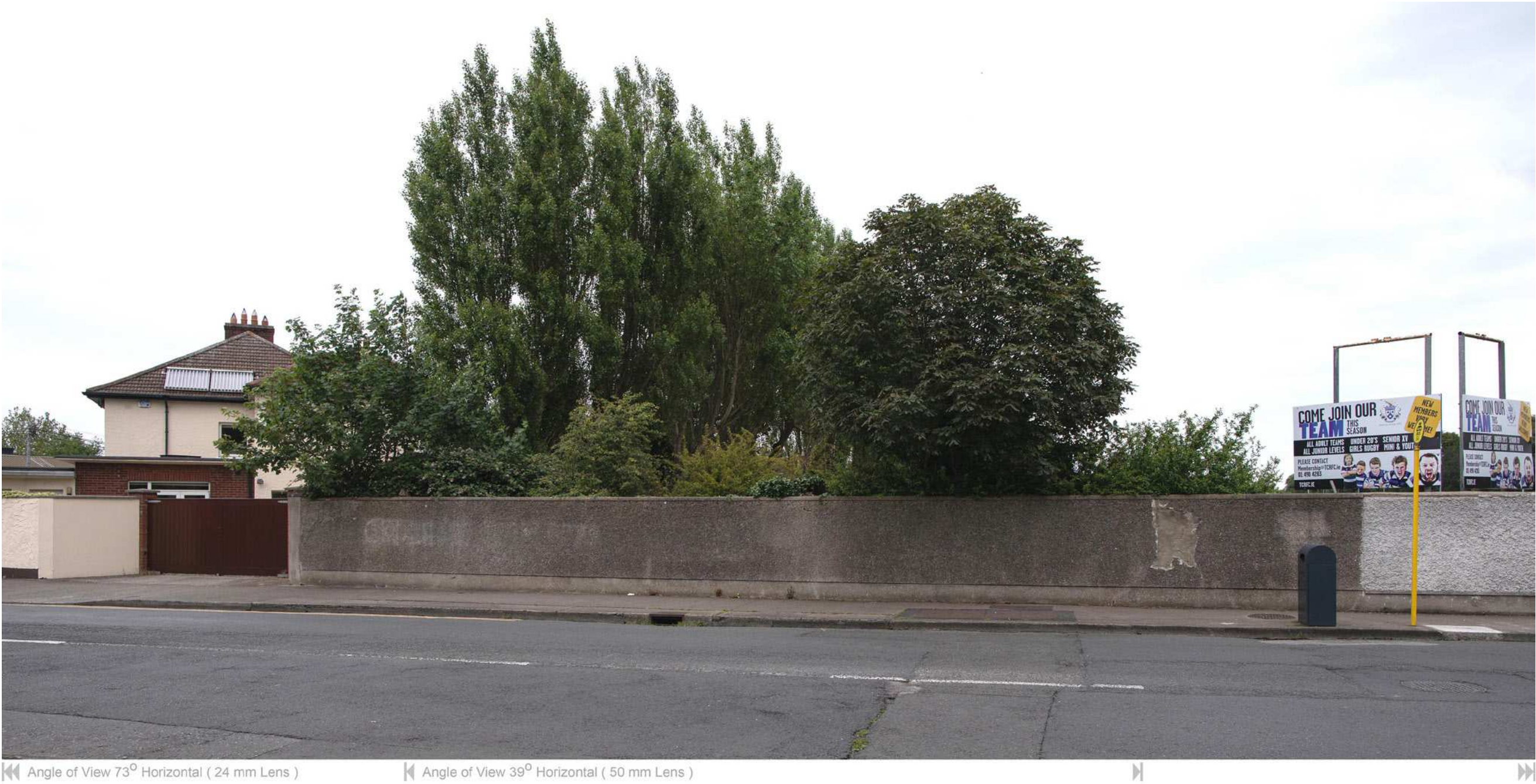
Angle of View 73° Horizontal ( 24 mm Lens )

NOTE: This document is for discussion purpose only. All figures shown are an approximate estimation and are subject to further design development, accurate site survey and services (drainages, ESB, gas, etc.) and potential existing site restrictions (flooding, trees preservation, traffic, fire etc.). Please note also that any proposed concept layout in this document is subject to full planning permission being granted.