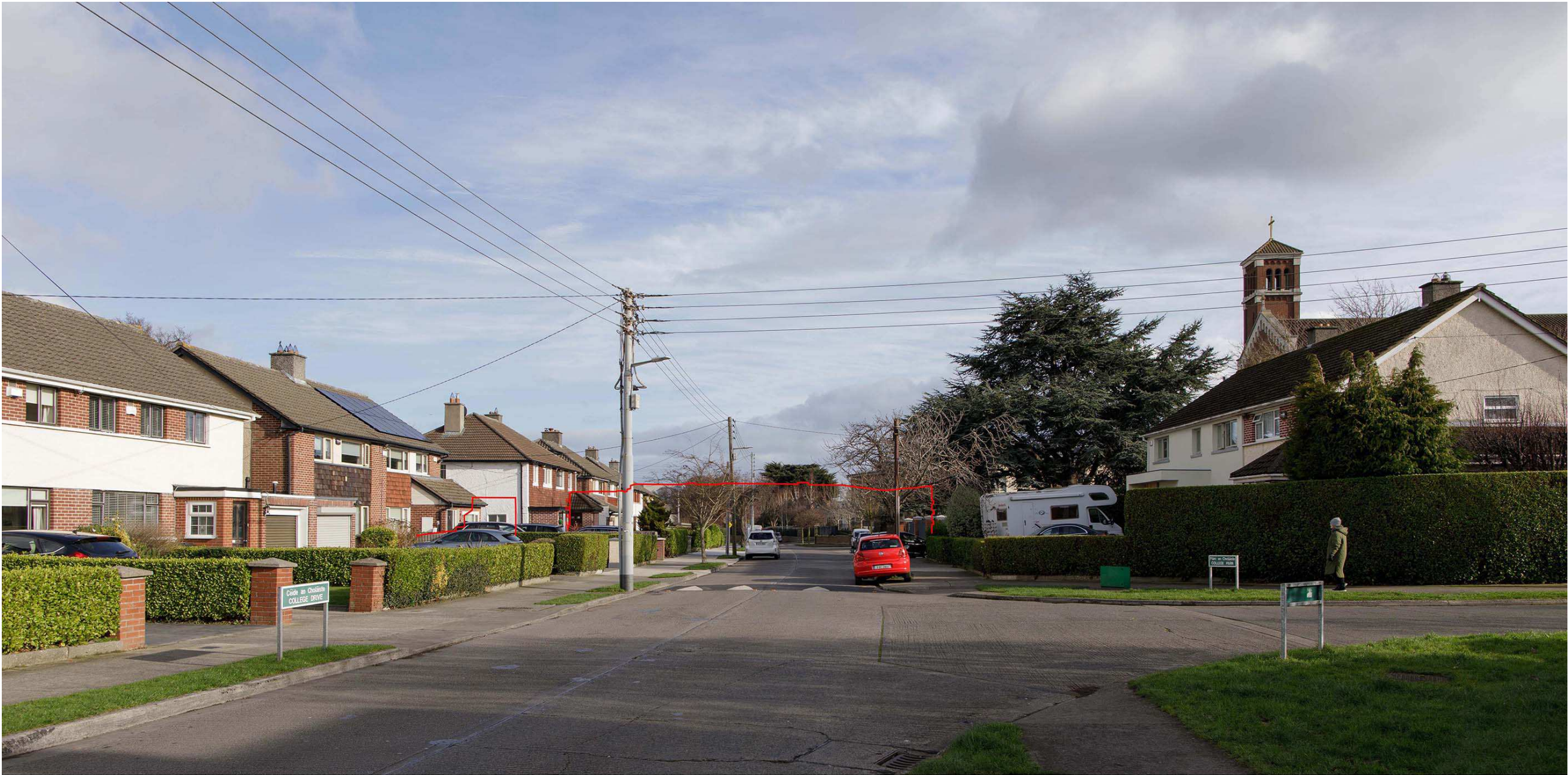
◀◀ Angle of View 73° Horizontal ( 24 mm Lens ) ◀ Angle of View 39° Horizontal ( 50 mm Lens ) ▶▶

NOTE: This document is for discussion purpose only. All figures shown are an approximate estimation and are subject to further design development, accurate site survey and services (drainages, ESB, gas, etc.) and potential existing site restrictions (flooding, trees preservation, traffic, fire etc.). Please note also that any proposed concept layout in this document is subject to full planning permission being granted.