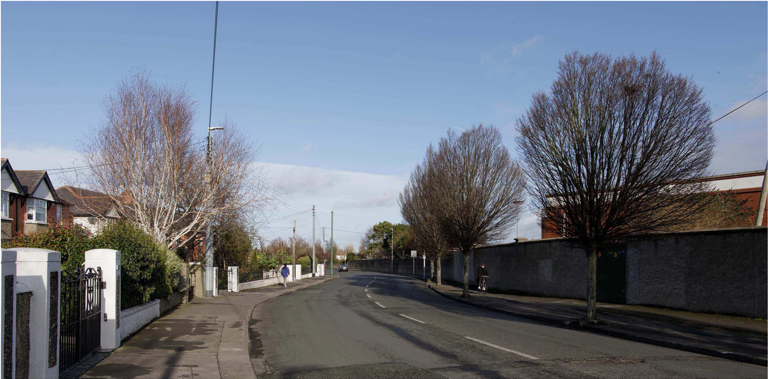
Angle of View 73° Horizontal ( 24 mm Lens ) Angle of View 39° Horizontal ( 50 mm Lens )

NOTE: This document is for discussion purpose only. All figures shown are an approximate estimation and are subject to further design development, accurate site survey and services (drainages, ESB, gas, etc.) and potential existing site restrictions (flooding, trees preservation, traffic, fire etc.). Please note also that any proposed concept layout in this document is subject to full planning permission being granted.